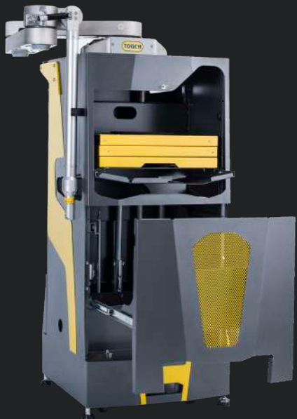
Touch Measuring System* (Part #92TOUCH180-CPC)