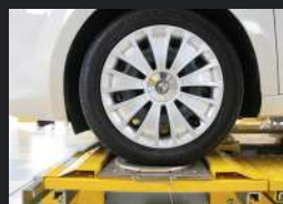
Couple swinging plates