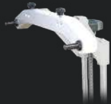
n.2 couple extensions 19"-24"